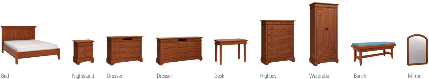
Bed Nightstand Dresser Dresser Desk Highboy Wardrobe Bench Mirror