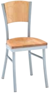
526 Chair with wood seat and back.

Amply rounded frames and distinctive back designs distinguish Artisan. Custom designs available.