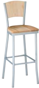
526BS Barstool with wood seat and back.