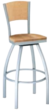
6526BS Swivel barstool with wood seat and back.