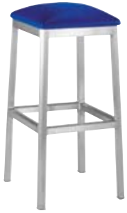
Atoll 710BS Aluminum angled barstool with upholstered seat.

Quality construction and attention to detail. A variety of designs in steel and aluminum make Atoll stools easy to coordinate.