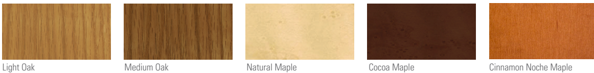
Light Oak Medium Oak Natural Maple Cocoa Maple Cinnamon Noche Maple

Color Disclaimer Please order actual material samples for specifying purposes. Color accuracy is not guaranteed with these images.