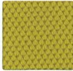
FORM TREE MOSS