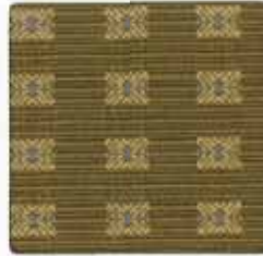
VENUE GRANNY SMITH