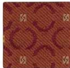
CONTEXT FALL SONG