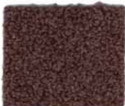
1005246 Black Pearl