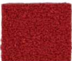
1005247 Blood Orange