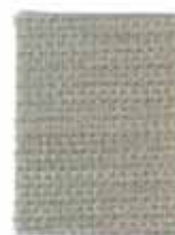
1005225 Sea Mist