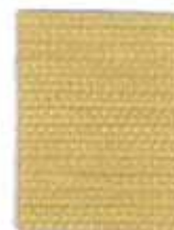
1005229 Star Fruit