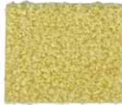
1005237 Star Fruit