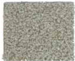
1005240 Sea Mist