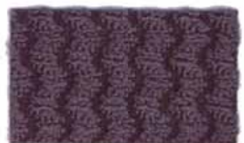
1005209 Dutch Boy