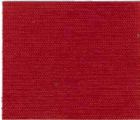
1005223 Blood Orange