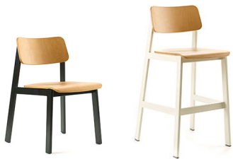
837-WD - Chair, Wood Seat & Back