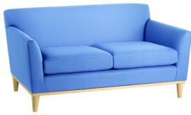
Settee 65"W x 32"H x 35"D. Seat height 18".