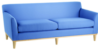
Sofa 82"W x 32"H x 35"D. Seat height 18".