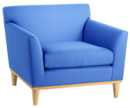
Chair 40"W x 32"H x 35"D. Seat height 18".