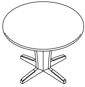
Round with X-Base