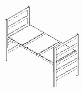
Tool Free Bed - 3-Piece Deck Open Market