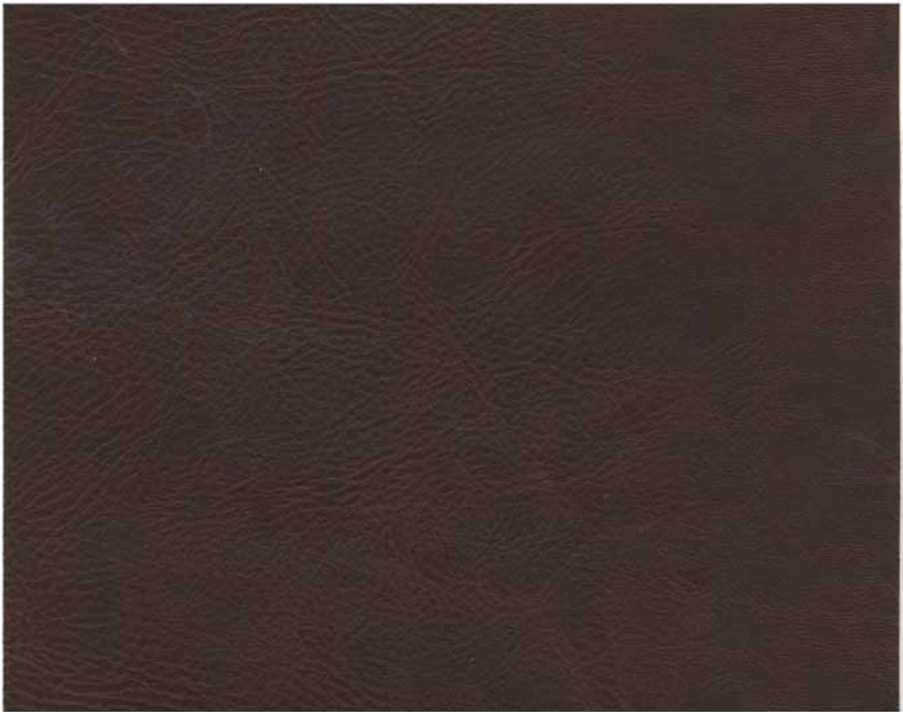
Old Bronze SVI-008

To experience the distressed leather appeal of Vintage STRETCH IT • CREASE IT