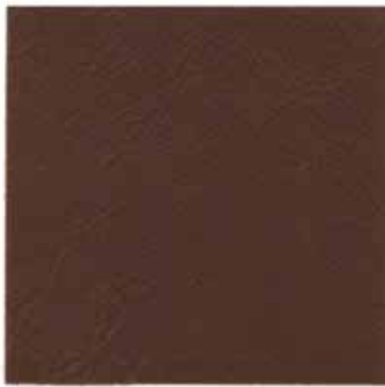
English Toffee SVI-005