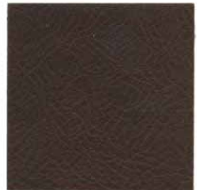
Old Bronze SVI-008