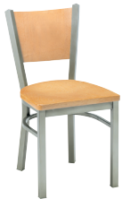
Chair - 504 Wood Back