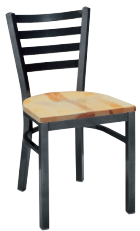
Chair - 501