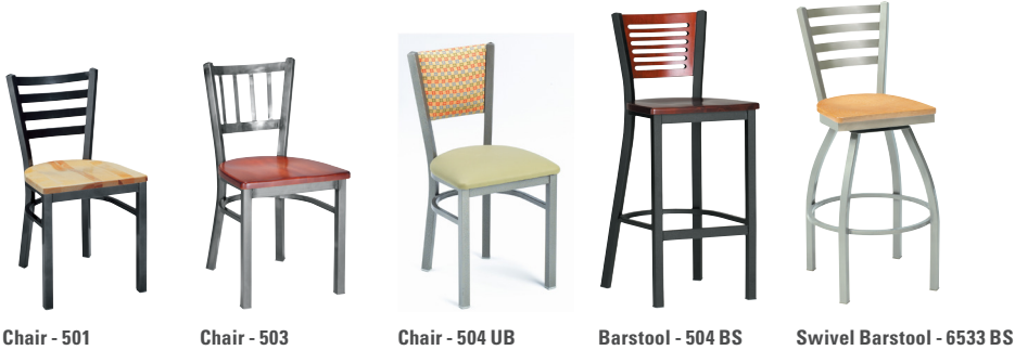
Chair - 501