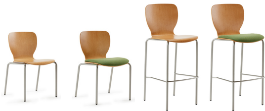
Stacking Chair Stacking Chair Barstool Barstool