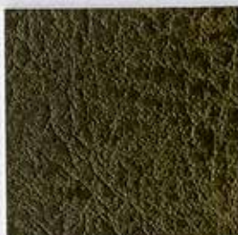
544-4474 Waxed Canvas