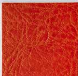
544-8211 Tiger Lily